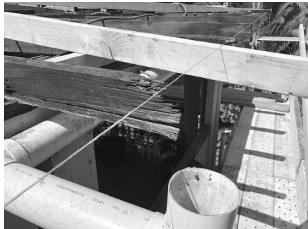
Rotten timbers in veranda roof