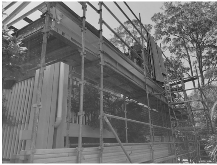
Scaffolding required for replacement of guttering

As you know, last year urgent repairs were undertaken to the presbytery at the Lindfield end of the parish, to address major problems with groundwater, mildew and roof run-off. We are grateful for the $40,000 plus donated by parishioners to address these works. However, much work remained to be done and so the parish has taken out a $75,000 loan to complete these essential works which include: replacement of all guttering, replacement of the veranda roof, repairs to the section of the dining room ceiling which fell in two years ago, repair to hole in lounge room wall eaten by rats two years ago, and a number of other things. The work will take three weeks to complete.