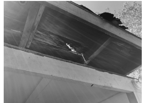
Nice view of the sky through the timbers of the eaves!